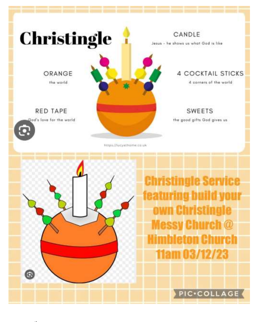
Week Commencing 27<sup>th</sup> November 2023

You are all welcome to come into the UKS2 classroom at the end of the school day to enjoy a piece of birthday cake in celebration. Please note: Football and Book Club will still be running, as will After School Care.